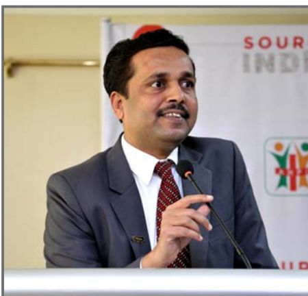
Mr. Rajesh Swami Deputy High Commissioner, High Commission of India, Nairobi