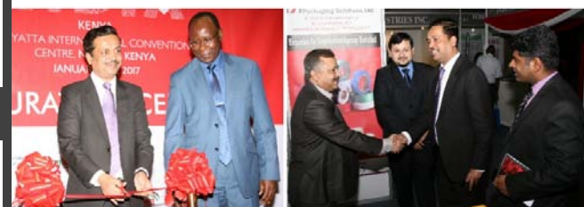
NAIROBI (Xinhua) – Rajesh Swami (L), Deputy High Commissioner of India to Kenya cuts the ribbon during the official opening ceremony of Source India - Kenya Exhibition in Nairobi. (RIGHT) Manoj Singhai (L), Managing Director of Millennium Packaging Solutions Limited shakes hands with Rajesh Swami (2nd R), Deputy High Commissioner of India to Kenya during the official opening ceremony of Source India - Kenya Exhibition in Nairobi, Jan 11, 2017. "Source India" focuses on cost effective promotion of Indian businesses and facilitate direct access to buyers in potential foreign markets.