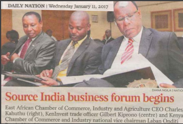
Daily Nation - January 11, 2017